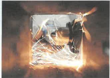
Applicable Grinding Wheel (commercially available)