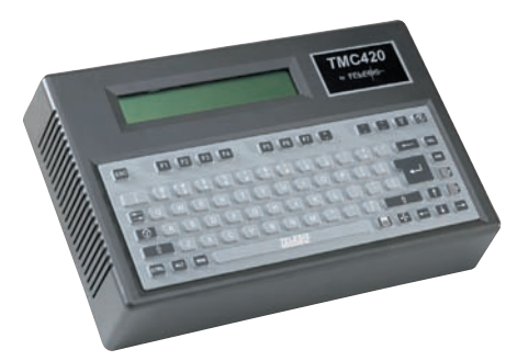
Compact TMC420 Controller features 4-line LCD Display — no PC required.